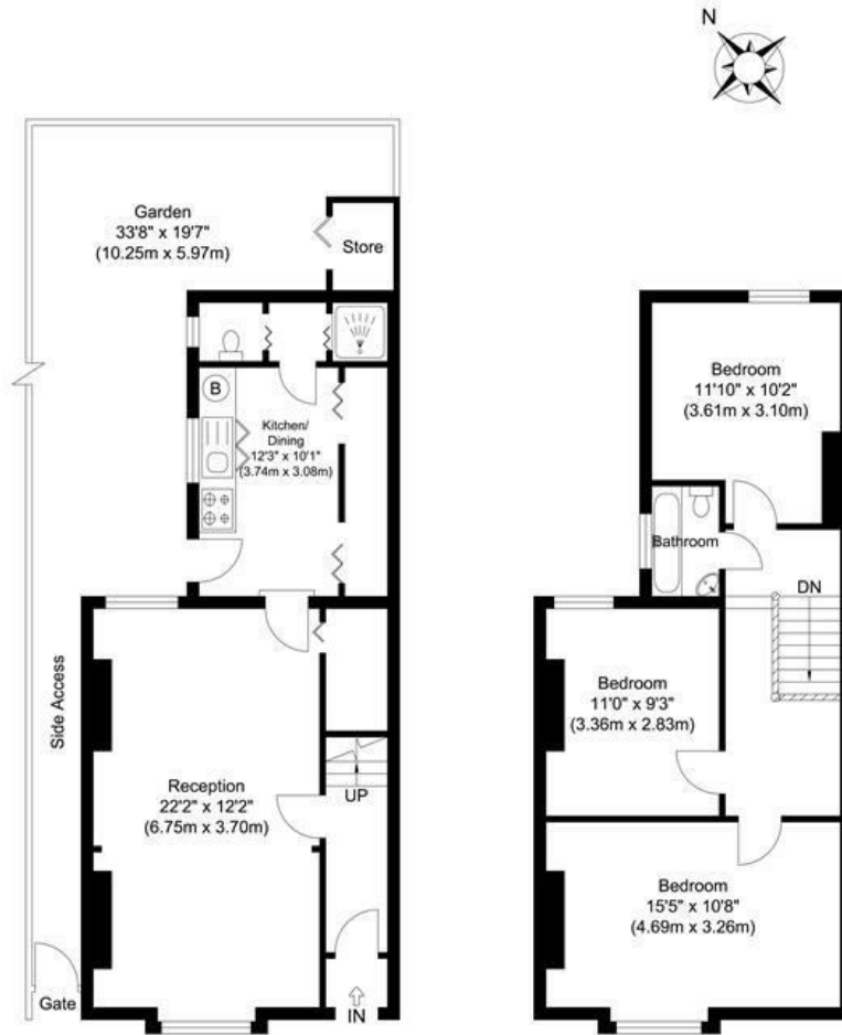
Ground Floor Approximate Floor Area 507.30 sq. ft. (47.13 sq. m)